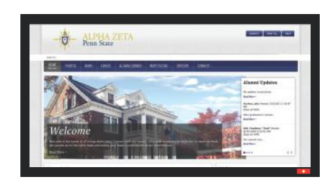
To Get Current News, Share Memories, See the Honor Roll, AND TO DONATE! Visit Our Website: www.alphazetapsu.com