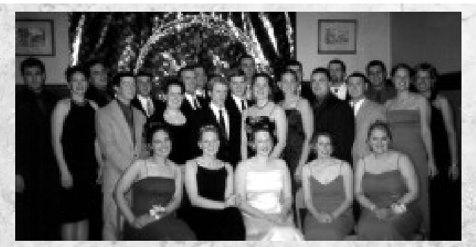
Alpha Zeta Brothers and Sisters at the Winter Formal, a combine held with Sigma Alpha, on December 1, 2001, at the fraternity house.