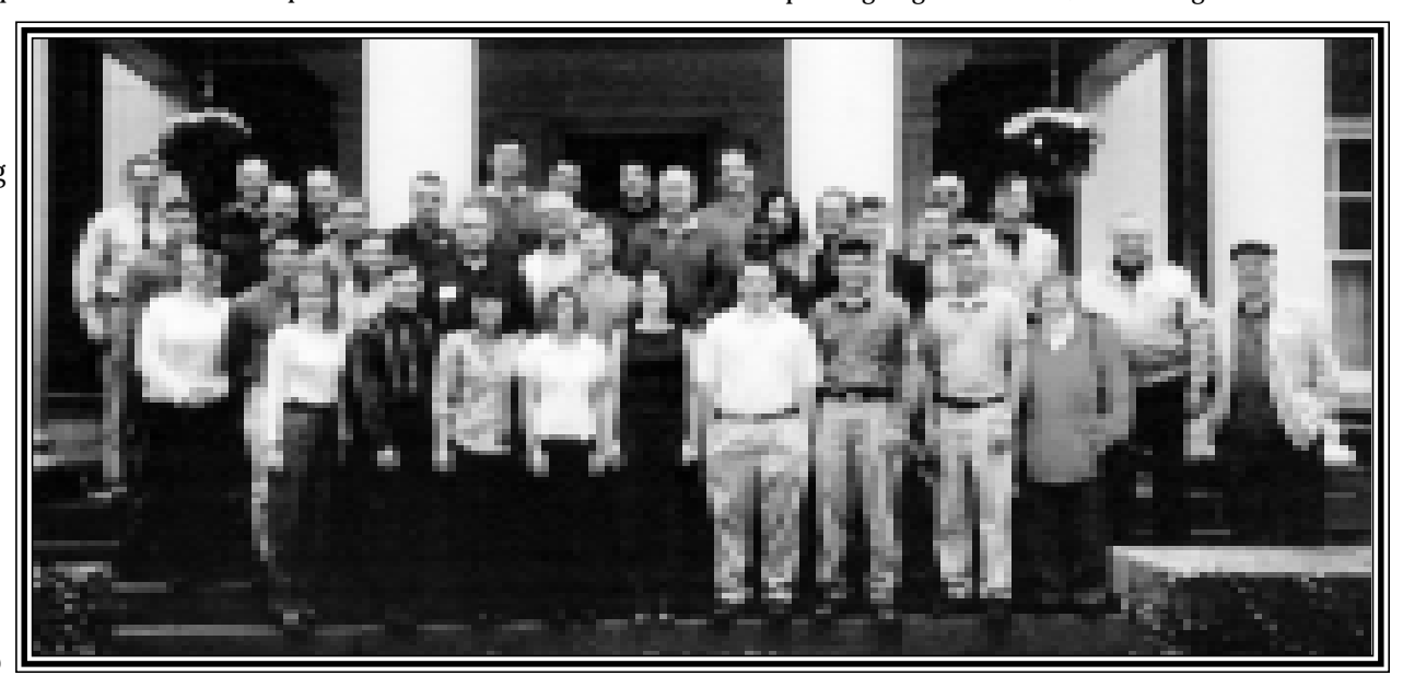
Alpha Zeta brothers, sisters and alumni enjoy a day together at the fall meeting of the Corporation Board.

Another topic of conversation focused on the possibility of a major fund-raising campaign to raise funds for the modernization of the house's electrical wiring and plumbing. There was much input on this topic, and it was the general consensus that a fund-raising campaign would be a good thing to launch in the near future.